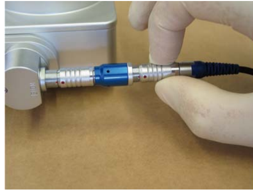
Connecting the 4-pin socket from the connecting cable of the BIOM ® 4c/BIOM ® 5c/BIOM ® 5cl with the plug adapter BIOM ® 4c/SDI ® 3c.

Beware that only the plug of the BIOM ® connecting cable is sterile, do not touch anything else.