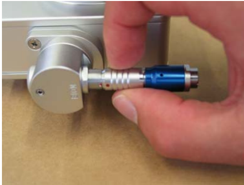
Connecting the 2-pin socket on the SDI ® 3c housing with the plug adapter BIOM ® 4c/SDI ® 3c.

The plug on the current 4-pin connecting cable from the BIOM ® 4c/BIOM ® 5c/BIOM ® 5cl needs to be converted to the 2-pin socket on the SDI ® 3 housing.