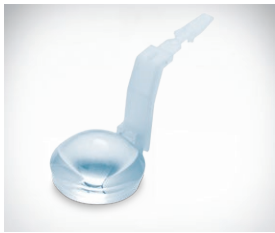
BIOM® HD Disposable Lens