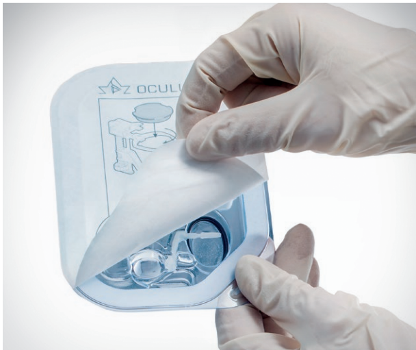
Convenient and sterile blister package*