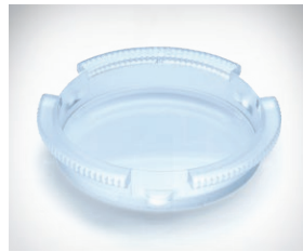
New reduction lens increases surgical efficiency